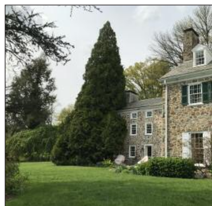
Home of Green Valleys Watershed Association