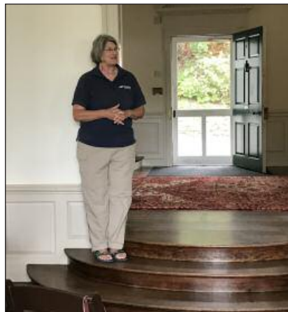
Representative of the Green Valleys Watershed sharing Welkinweir history