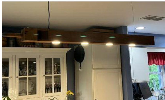
Creative pipe reuse by Vince Ryan: "now hanging proudly above our dining room table"