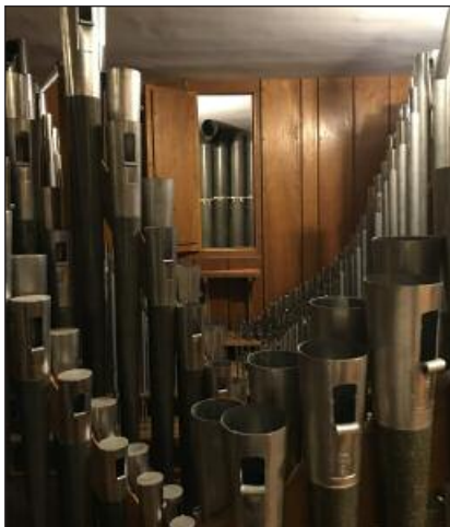
The E. M. Skinner Player Pipe Organ rescued from Park Ave. in the 1930s