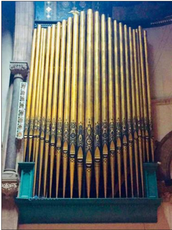
Whitelegg-Moller, 4 manual