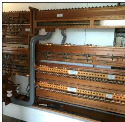
Complex Inner Workings