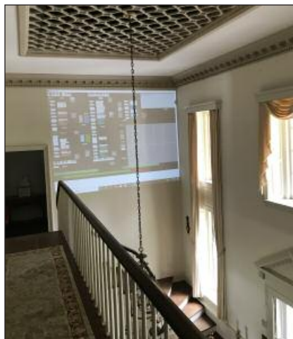
Real time broadcast of the player organ function